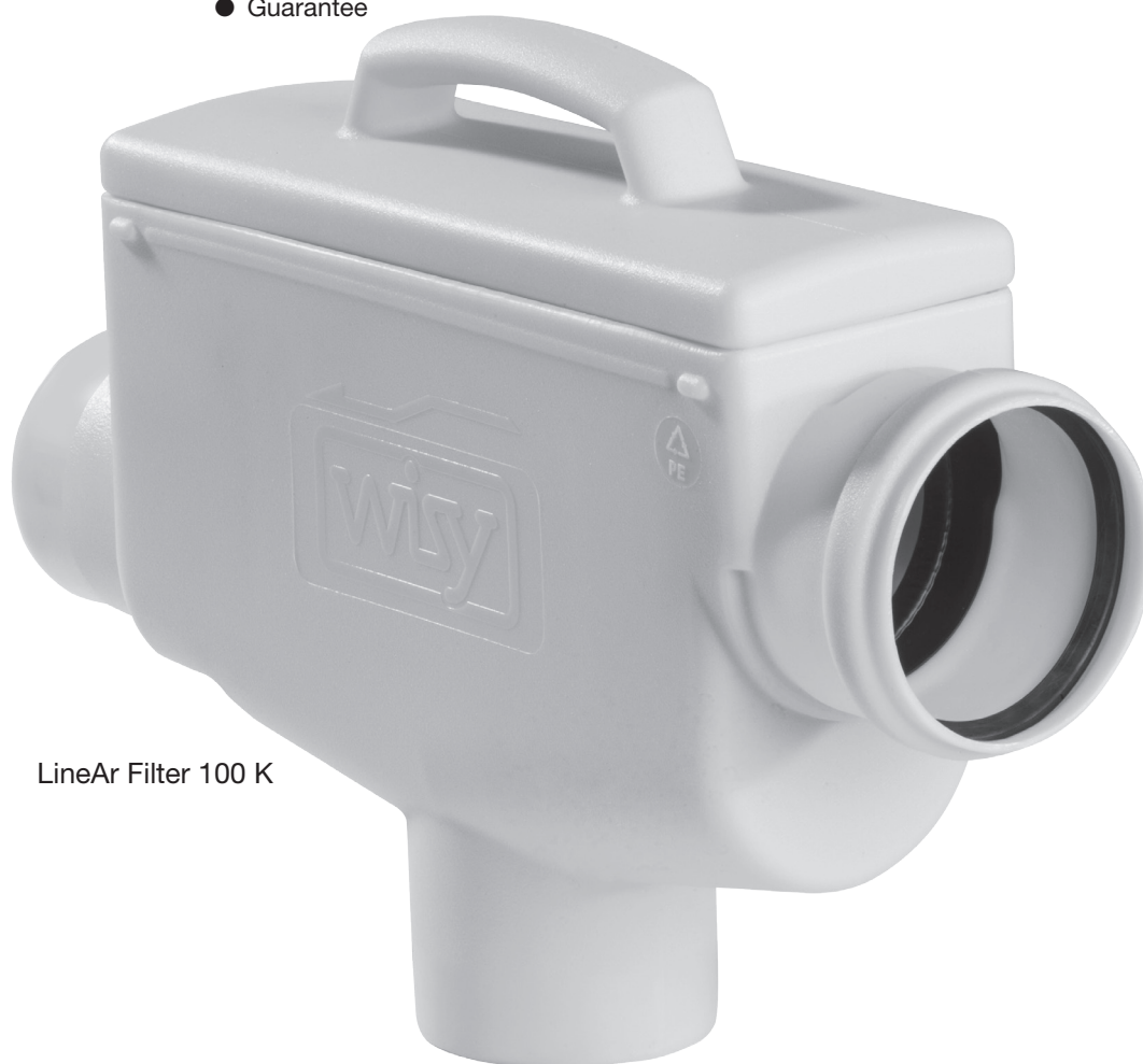
LineAr Filter 100 K